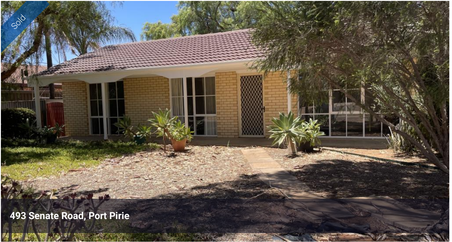
493 Senate Road, Port Pirie