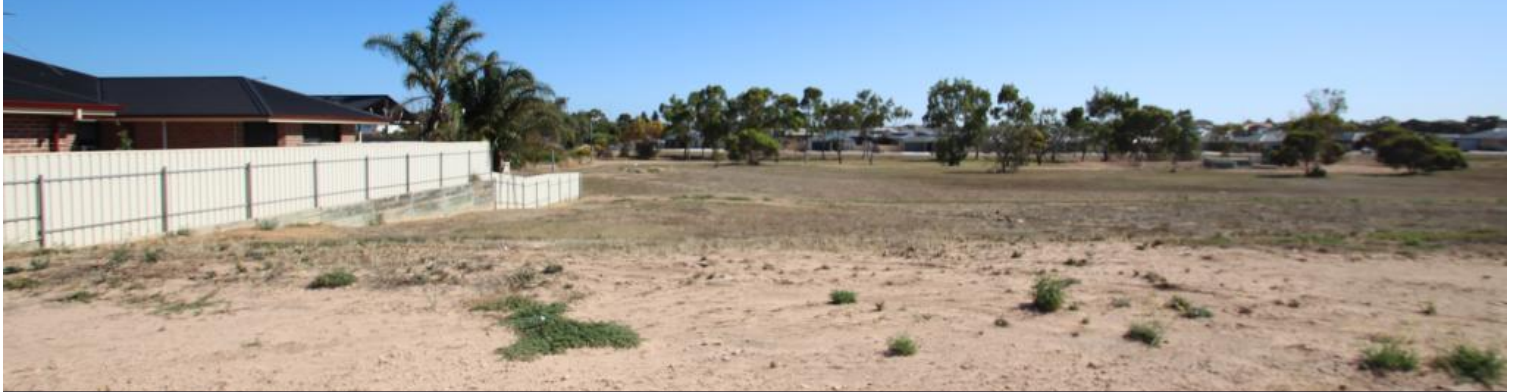
15 Woodward St, Moonta Bay