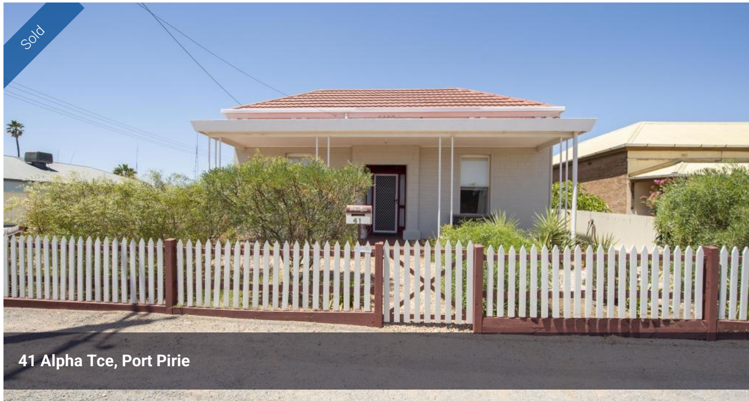
41 Alpha Tce, Port Pirie