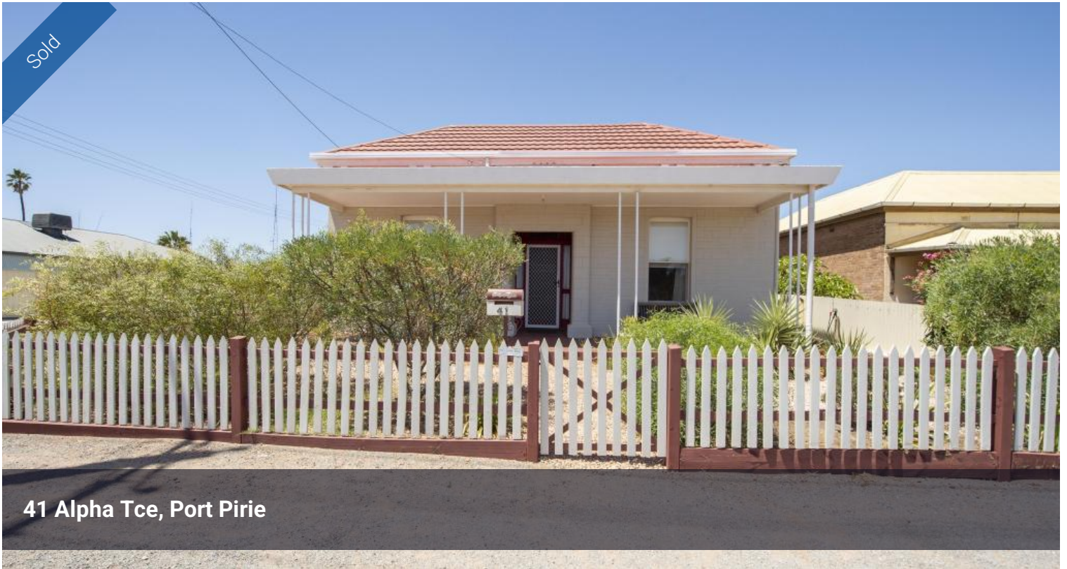
41 Alpha Tce, Port Pirie