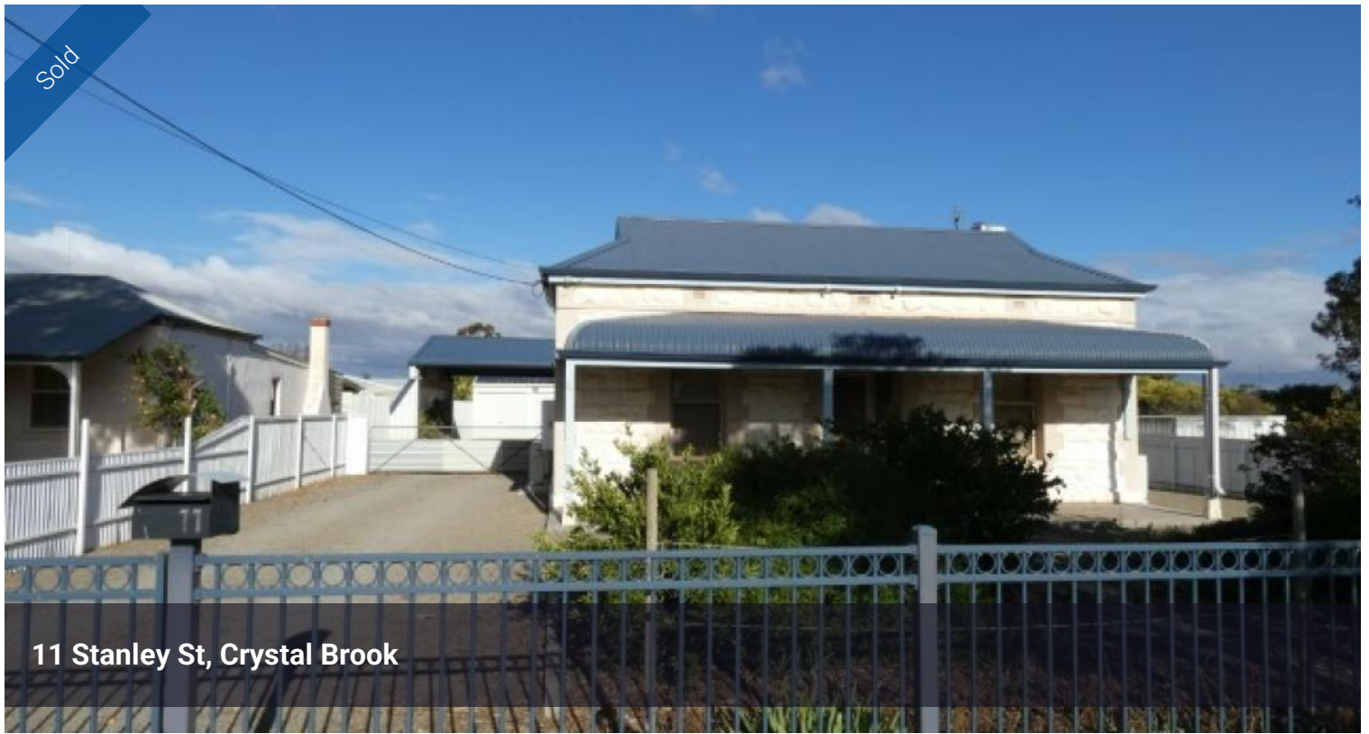
11 Stanley St, Crystal Brook