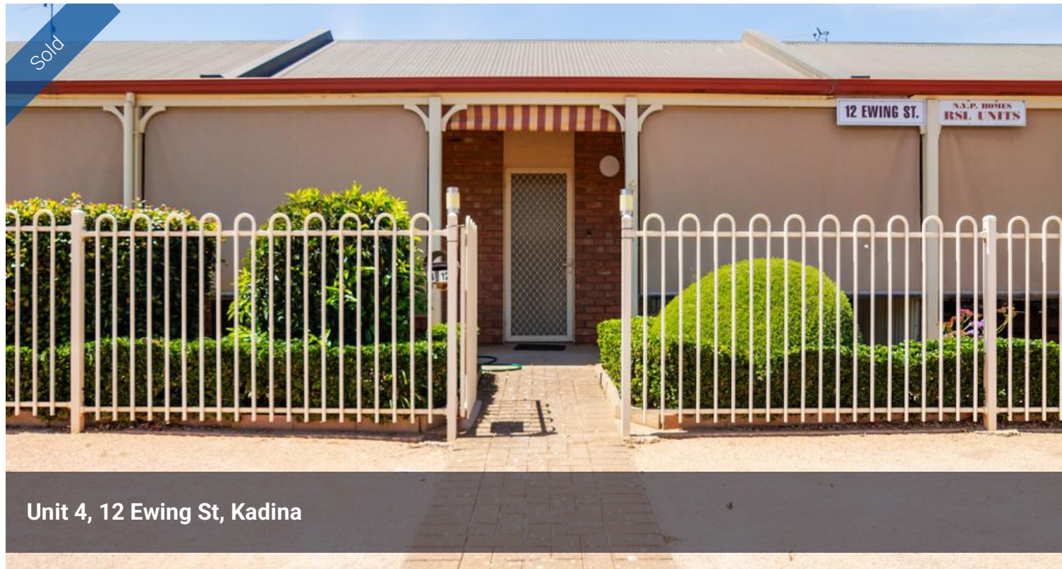
Unit 4, 12 Ewing St, Kadina