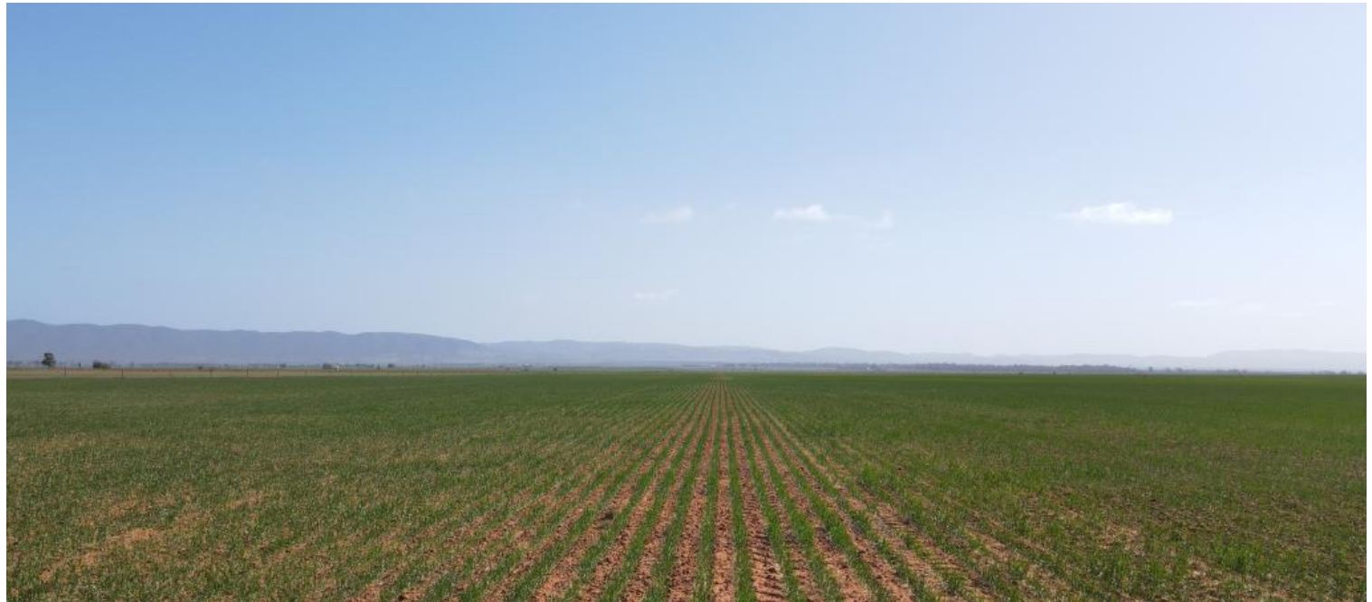
'Daly's' Collins Road, Willowie