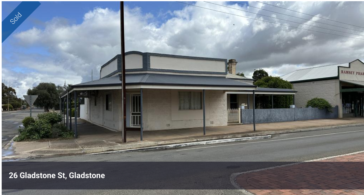
26 Gladstone St, Gladstone