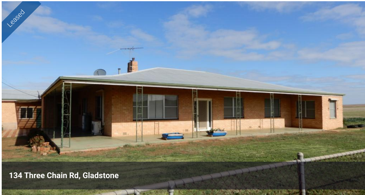
134 Three Chain Rd, Gladstone